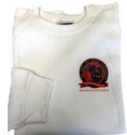
Donated "Thank You" gift O&B Logo Sweatshirt (XL Only)

Sign up today and receive a donated Onyx & Breezy sweatshirt as a thank you gift (XL only). of your choosing, will receive a donated "Thank You" gift from The Onyx & Breezy Foundation.