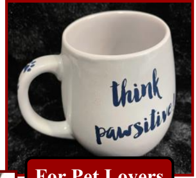
For Pet Lovers