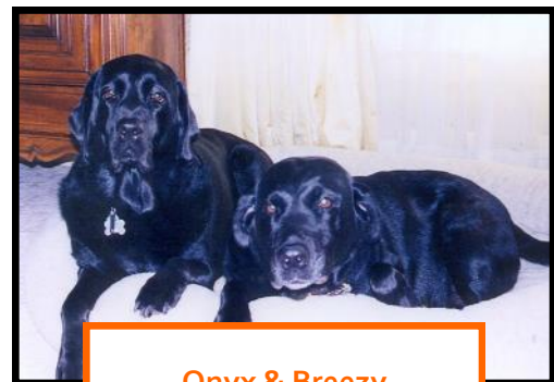
Onyx & Breezy