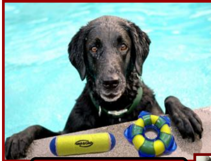
For Your Pet