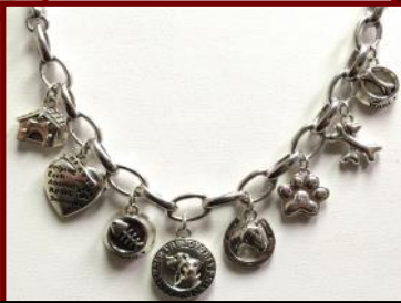
O&B Exclusive Jewelry